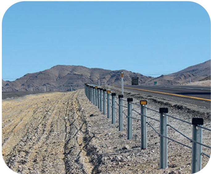
NCHRP 350 tested and rated